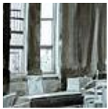
Window, The Big Room. £500

I hadn't brought coloured paper big enough for what I wanted to do with my drawing so searched around a bit and found a nice piece of cardboard.... just like Toulouse-Lautrec!