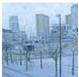
Salford Quays Panorama £2000

'The shoreline and water near the BBC's new headquarters is littered with rubbish again – after the boat that keeps the area clean sprung a leak and sank. Nearby Merchant's Quay has filled with debris after the Salford Quays Water Witch – a dredger... went down '- Manchester Evening News 18th January 2012 . Thankfully normal service has now resumed.