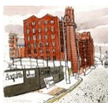
Cambridge Street. £400