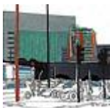
Civil Justice Centre, and car park. £500

Opened on 24 October 2007, the Manchester Civil Justice Centre is the biggest court complex to be built in the UK since the Royal Courts of Justice in London 1868-82