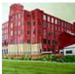
Newtown (Lowry) Mill, from the Bowling Green, Swinton. £1,200 SOLD

"Within a matter of only weeks of its opening, Metrolink became a huge success for Greater Manchester. It brought, not only to the Greater Manchester area, but to the United Kingdom as a whole, a new concept in public transport in the form of the country's first modern street operating light rail system."