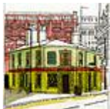
Peveril of the Peak ( print ) SOLD **

Dated 1819, and still in use as a chapel.