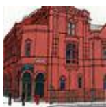
Salford Lads Club 2 sold

‘The Kings Arms is a pub, music venue and theatre with artist's studios. A bit more than your average boozier.’