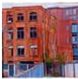
Factory by the Canal, Castlefield. £1,000