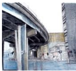
Mancunian Way £750

On Grosvenor Street near the Oxford Road corner is a club called by the unusual name of "The Deaf Institute". It occupies a building that was formerly the Adult Deaf and Dumb Institute.