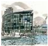
Salford Quays, the BBC and Dredger. £400