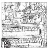
The Big Room, Keys £600