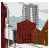
Blueprint Studios. £500