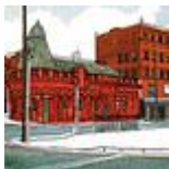
The Old Police Station. £500

Salford Quays was previously the site of Manchester Docks, it became one of the first and largest urban regeneration projects in the United Kingdom following the closure of the dockyards in 1982.