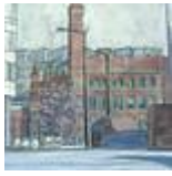
Barbarolli Square. £1,000

(click on the thumbnails to open the images on flickr)