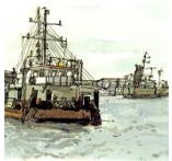
Dredging at Salford Quays. £400

'The shoreline and water near the BBC's new headquarters is littered with rubbish again – after the boat that keeps the area clean sprung a leak and sank. Nearby Merchant's Quay has filled with debris after the Salford Quays Water Witch – a dredger... went down '- Manchester Evening News 18th January 2012 . Thankfully normal service has now resumed.