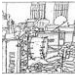
The Big Room, Drums £500