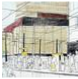
Waiting for the tram, Market Street. £750