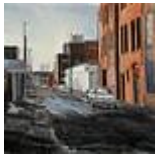
Bent Street, Cheetham. £1,200 SOLD

This ornate building, one of the landmarks of the city, was built in 1899 on the site of a pub which had opened for business in 1805, the year Vice Admiral Lord Viscount Nelson died as his fleet defeated the French and Spanish. I've been shocked to observe the gradual decay that years of neglect have wrought on this beautiful building. In its present state it has no roof and pigeons are the only life-form to gather here. It was feared that it would be demolished, but happily there's been a reprise, due to the extensive 'tartification' of this area.