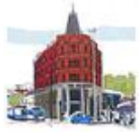
Cornerhouse Blue. sold

The collages started when I was away from home with just my pen and ink with me, and a pile of magazines.