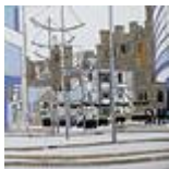
Exchange Square. £650

Exchange Square was heavily redeveloped after the IRA bombing of the city centre in 1996. This reconstruction included the moving of two ancient buildings- Sinclairs Oyster Bar and The Old Wellington Inn which date back to the 14th century.