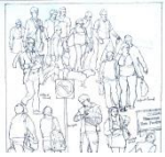
Street People, Manchester and Salford. £600