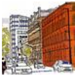
Princess Street £500

Islington Mill is a former cotton spinning mill in Salford. Home to over 50 artists' studios, a gallery space, a B&B and a club space, it's one of the few creative spaces in Salford.