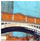
Bridge Street and Beetham Tower. Sold.

The collages started when I was away from home with just my pen and ink with me, and a pile of magazines.