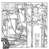
The Big Room, Flight Case £600