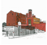
Islington Mill, Salford. £500

Islington Mill is a former cotton spinning mill in Salford. Home to over 50 artists' studios, a gallery space, a B&B and a club space, it's one of the few creative spaces in Salford.