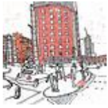
Hacienda Flats. £400