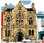
The Deaf Institute sold

On Grosvenor Street near the Oxford Road corner is a club called by the unusual name of "The Deaf Institute". It occupies a building that was formerly the Adult Deaf and Dumb Institute.