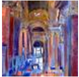
Inside the Royal Exchange £750