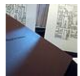
Boxed set of 4 prints 'The Blueprint Sessions' £200 *