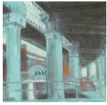
Castlefield One £1,200