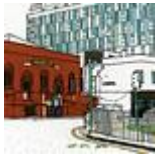
Hope Chapel , Salford. (print )

Dated 1819, and still in use as a chapel.