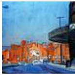
Shudehill, Torn Poster. £1,000

The earliest recorded mention of Shudehill was in 1554 but it is probably older. The name of the street may derive from the word 'Shude' which means husks of oats, but this is uncertain.