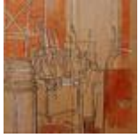
Elbow's Guitars, on cardboard. £700

I hadn't brought coloured paper big enough for what I wanted to do with my drawing so searched around a bit and found a nice piece of cardboard.... just like Toulouse-Lautrec!