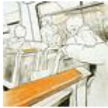
On board the tram from Salford Quays. £600