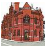
Kings Arms, Salford. sold

Exchange Square was heavily redeveloped after the IRA bombing of the city centre in 1996. This reconstruction included the moving of two ancient buildings- Sinclairs Oyster Bar and The Old Wellington Inn which date back to the 14th century.