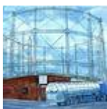
Gasometer, Liverpool Street. £1,200

.A cold, cold day in the city, but this scene warmed my heart.