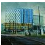
Media City. £2,000

The Black Lion, Salford is where John Cooper Clarke performed his first gig, it's where the Vegetarian Society was set up and where the Suffragette movement began