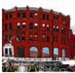
Hacienda 2 ( Print )

Mounted and Framed : £185, Mounted and Unframed : £145 To Order ( postal tube ) : £135