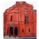
Salford Lads Club 1 ( print ) SOLD