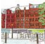
Canal Street. £500

Located on a peninsula of land between Chapel Street and the Salford Approach to the former Exchange Station, the former Chapel Street Police Station was built in 1888 by Arthur Jacob, the Salford Borough Engineer.