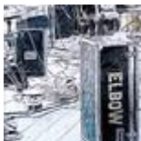
Flightcase, Blueprint £800

The Mancunian Way was officially opened by Prime Minister, Harold Wilson, on 5 May 1967. At the time of its opening the Manchester Evening News referred to it as the "highway in the sky".