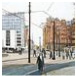
St Peter's Square. £1,000 SOLD

Wandering the back streets, I came upon this atmospheric scene and had to make a picture of it. "Long existing as an industrial district, Cheetham Hill is the home of a multi-ethnic community, a result of several waves of immigration to Britain. In the mid-19th century, Cheetham Hill attracted Irish people fleeing the Great Famine. Jews settled in Cheetham Hill during the late-19th and early-20th centuries, fleeing persecution in continental Europe. Migrants from the Indian subcontinent and the Caribbean settled in the locality during the 1950s and 1960s. Since that time, Cheetham Hill has attracted people from Africa, Eastern Europe and the Far East, all contributing to a diverse, cosmopolitan community."