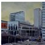
Victoria Bridge, Beatles Poster. £1,000

.A cold, cold day in the city, but this scene warmed my heart.