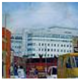
Yellow Van, Chapel Street. £900

The earliest recorded mention of Shudehill was in 1554 but it is probably older. The name of the street may derive from the word 'Shude' which means husks of oats, but this is uncertain.