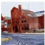
Old Tennis Courts, Blackfriars Road. £1,000

The re-vamping of the square includes a 'landmark office development' which will tower over the neighbouring Grade 11 listed buildings.