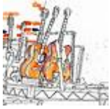
Guitars in the Big Room, Blueprint studios. £500