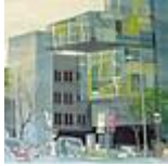
Civil Justice Centre. £1,000