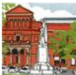
Salford Museum and Art Gallery (print )