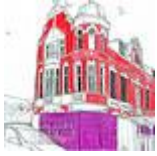
The Olde Nelson, Derelict, Chapel Street. £1,000

This ornate building, one of the landmarks of the city, was built in 1899 on the site of a pub which had opened for business in 1805, the year Vice Admiral Lord Viscount Nelson died as his fleet defeated the French and Spanish. I've been shocked to observe the gradual decay that years of neglect have wrought on this beautiful building. In its present state it has no roof and pigeons are the only life-form to gather here. It was feared that it would be demolished, but happily there's been a reprise, due to the extensive 'tartification' of this area.